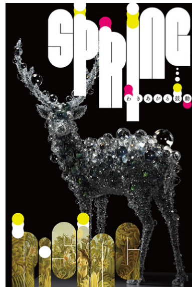
Top : Nawa Kohei, PixCell-Deer#72 (Aurora), 2022 Private Collection ©Kohei Nawa, Bottom : Henri Rousseau, Eve in the Garden of Eden, ca. 1906-1910, Pola Museum of Art

This exhibition also focuses on the Pola Museum of Art's painting collection, examining how painters pushed their work in new directions during Europe's long period of upheaval and renewal from the late 19th century to the present. Claude Monet, Vincent van Gogh, and Paul Gauguin responded to the shifting qualities of light and color, expressing in their paintings both the transience of passing moments and a yearning for permanence. The museum's remarkable group of paintings by Henri Rousseau is among the exhibition's highlights.