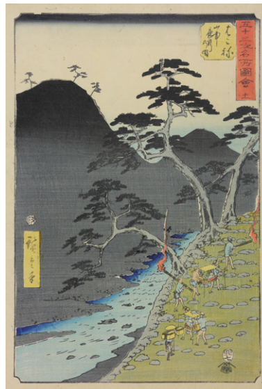
Utagawa Hiroshige, Hakone: Night Procession in the Mountains , no.11 from the series "Famous Sights of the Fifty-three Stations," 1855, Hakone Museum of History and Folklore

Spring is the time when life is reborn. Today, an era in which technology has overwhelmed society, people are beginning to reexamine and growing increasingly sensitive to natural wonders in their midst, memories of the earth beneath their feet, and the elemental human force. This exhibition focuses on paintings, sculptures, crafts, and installations, which illuminate the tremendous power of art, contain a pulse that sprouts up from people or the depths of the earth, and stir the senses and our very being.