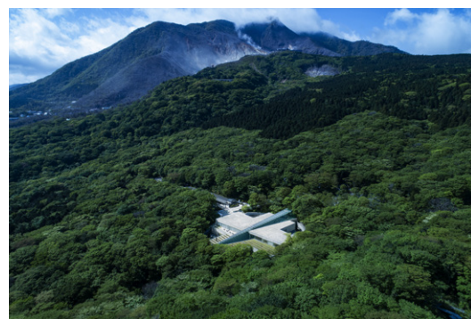
Pola Museum of Art