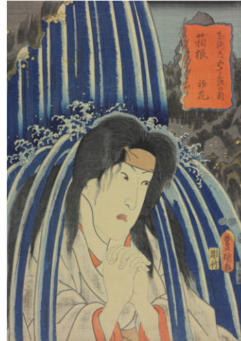
Utagawa Toyokuni III, Hakone: Hatsu-hana from the series "Fifty-three Stations of the Tokaido," 1852, Hakone Museum of History and Folklore