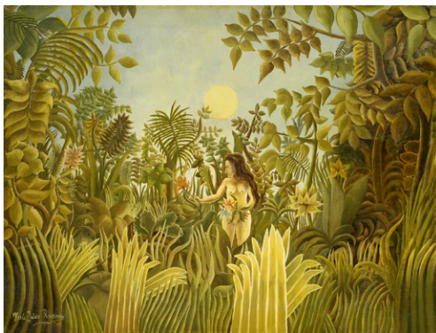
Henri Rousseau, Eve in the Garden of Eden , ca. 1906-1910, Pola Museum of Art