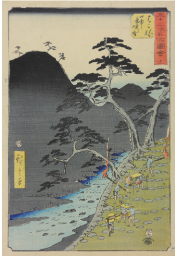
Utagawa Hiroshige, Hakone: Night Procession in the Mountains , no.11 from the series "Famous Sights of the Fifty-three Stations," 1855, Hakone Museum of History and Folklore