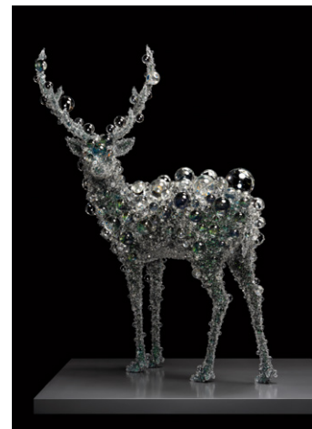
Nawa Kohei, PixCell-Deer#72 (Aurora) , 2022 Private Collection ©Kohei Nawa